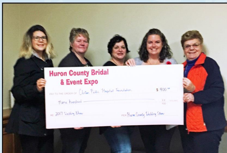
On November 8th, members of the Huron County Wedding Show Committee presented the CPH Foundation with $900.00, the proceeds from this year's Wedding Show.

For more information, please visit the "Ways To Help" section of our website.